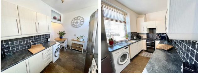
A section of kitchen photos: